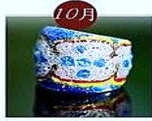
October 淚痕之珠 luseq nua qadaw 情懷纏綿思慧珠 The pearl of ancestral patron