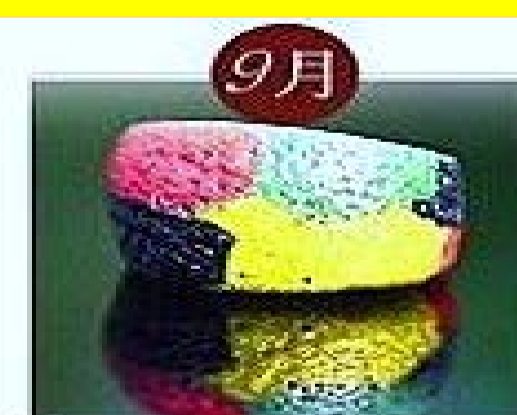
September 土地之珠 caidacadaqan 生生不息財富珠 The pearl of uncountable wealth