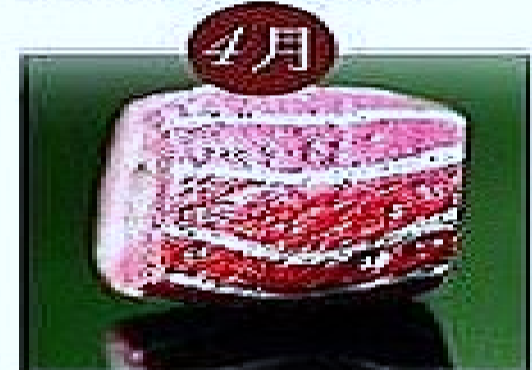
April 仕梳之珠 mulimulitun 乾坤神功伶巧珠 The pearl of actress between heaven and earth