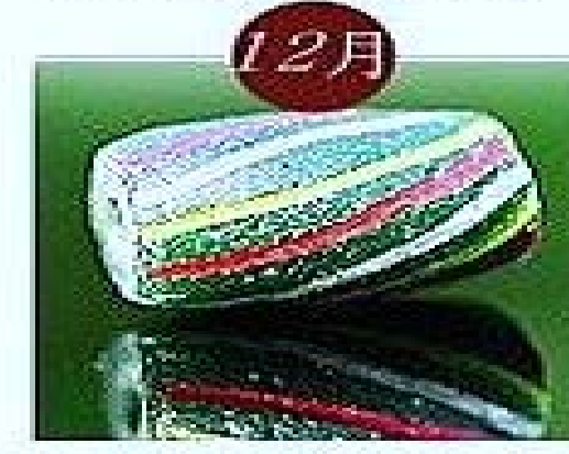
December 織工之珠 palic 心細手巧幸福珠 The pearl of delicate happiness