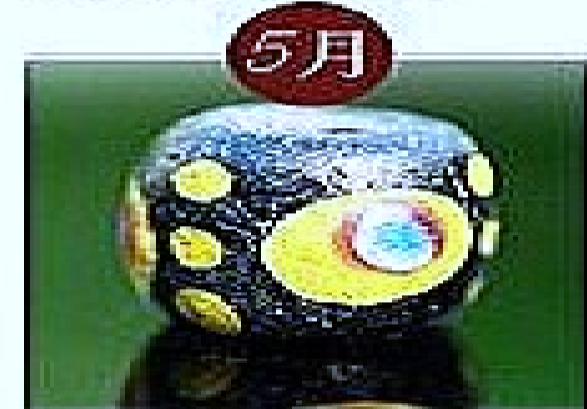
May 蜻蜓眼珠 quljiencenglaw 往日情懷典藏珠 The pearl of treasured past