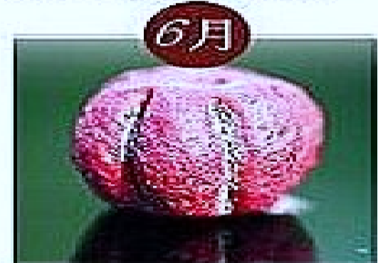
June 月牙之珠 aljis nua vavayan 聖女貞潔叮嚀珠 The pearl of saint purity's whisper