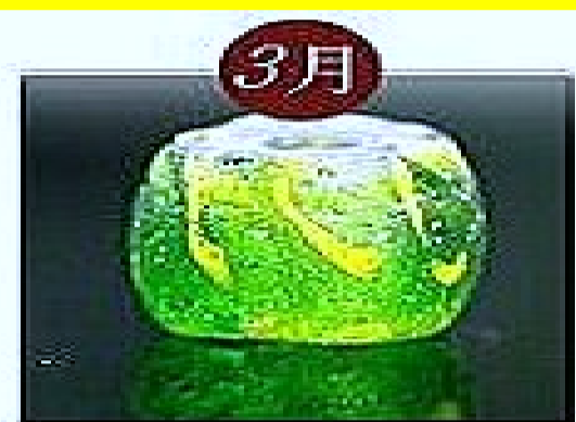
March 蝶蛹之珠 muru hamulang 翠綠豐裕豐收珠 The pearl of green rich harvest