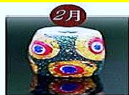
February 眼眸之珠 pustacacaca 祖靈天佑守護珠 The pearl of ancestral patron