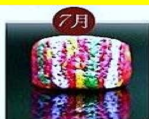
July 手腳之珠 makacaingaw 精明睿智智慧珠 The pearl of cleverwisdom