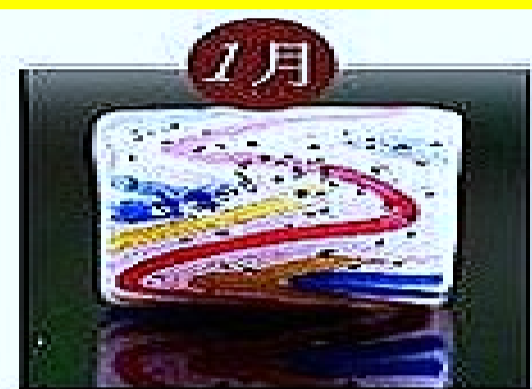
January 日光之珠 mulimulitun 尊容萬丈尊貴珠 The pearl of ancestral patron