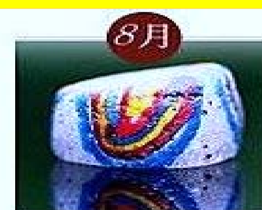
August 孔雀之珠 kurakuraw 鍾愛一生摯愛珠 The pearl of eternal love